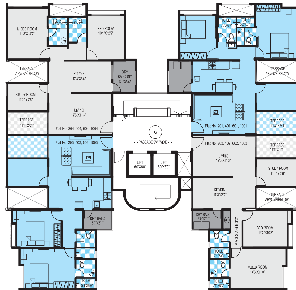
Typical Floor Plan - Even

bellavista 2.5 BHK Apartments at Kondhwa